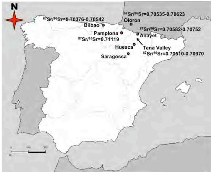
Fig. 1. Map of Iberian Peninsula showing the location of Pamplona with observed radiogenic strontium isotope signatures in bedrock and soil.

Iceland ( e.g. , Price and Gestsdóttir, 2006), the Alps ( e.g. , Müller et al. , 2003), Spain (Díaz-Zorita Bonilla et al. , 2009; Prevedorou et al. , 2009), and Greece ( e.g. , Nafplioti, 2008; Richards et al. , 2008).