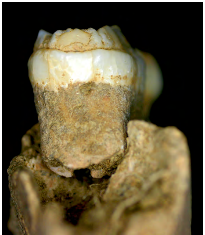
Fig. 8. Distal view of permanent lower right first molar showing circumferential plane-like defect with reduced crown size on coronal portion of the crown.