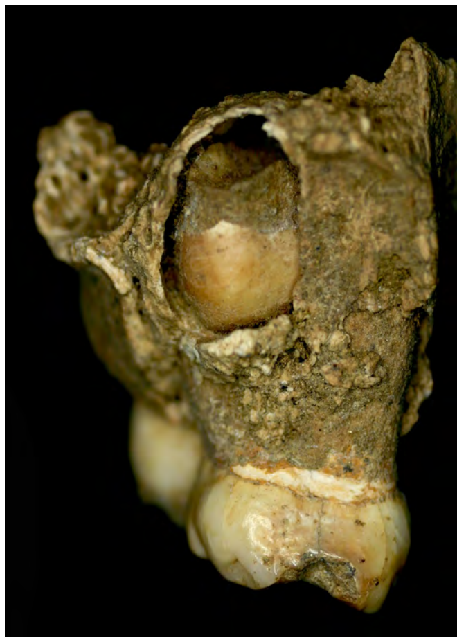
Fig. 15. B10-I11, view of the distal aspect of the maxillary right quadrant. The postmortem breakage of the alveolus exposes the second premolar so it can be used for dental aging.