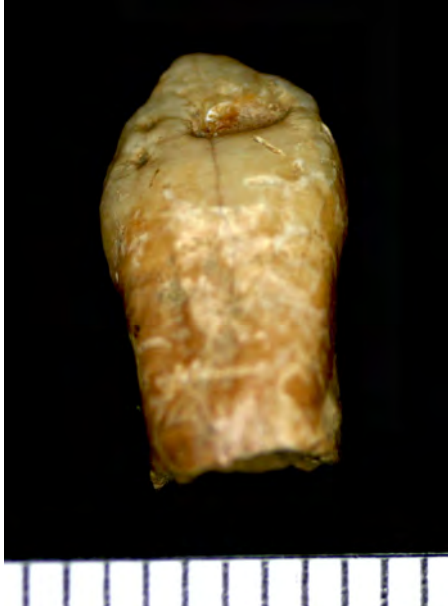
Fig. 5. Labial view of left maxillary canine showing occlusal crown reduction due to hypoplastic defects. Scale in millimeters.

syphilis because enamel does not remodel (as opposed to bone), and because enamel preserves well. A review of the literature, including case studies from historical, ancient, New World, and Old World groups, reveals a two-tier pattern of developmental defects resulting in the described dental stigmata. The first tier, or Level I defect pattern is a result of the genetic timing of tooth development; the second tier, or Level II defects, is an outcome of the environmental expression or, possibly, host response of particular stigmata.