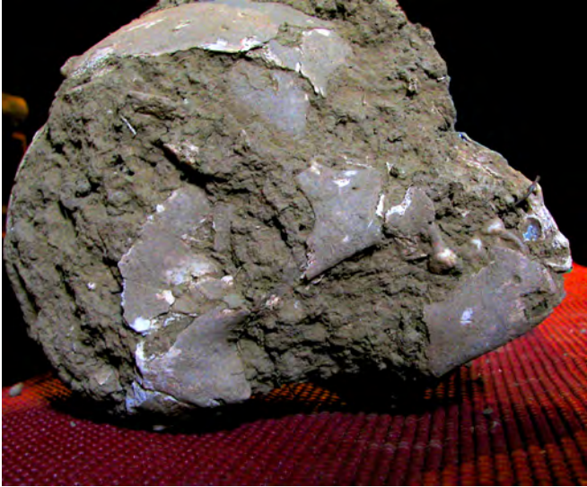
Fig. 18. B10-I11, right lateral view of skull showing taphonomic changes.

manifestations. Therefore, knowing and recognizing variation in symptomology of this disease in antiquity can be valuable. It may also be one of the keys to understanding and identifying various forms of this disease and its dispersion globally.