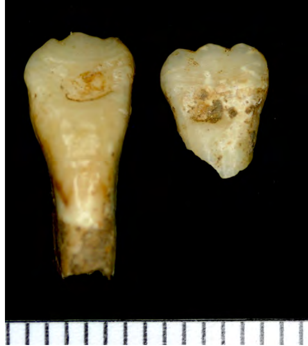
Fig. 21. Permanent mandibular central incisors with furrowed defect in the middle third of the crown; labial view. Distal is to the left of the photograph; scale in millimeters.

Skeletal investigations of pre-contact burials from Gabriola Island, Canada (Pacific Northwest) identified several individuals, adult and sub-adult, with skeletal changes that appear to be due to syphilis. Curtin (2005) describes a disassociated juvenile mandible, the teeth of whom match the current description of syphilitic stigmata, and which parallel case study (B10-I11) presented here, both in terms of the teeth affected and the degree of malformation.