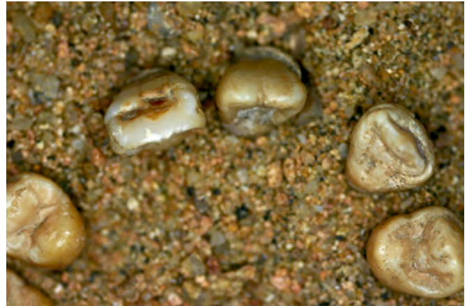
Fig. 6. Occlusal view of the maxillary teeth, showing the change in tooth shape of the central maxillary incisors, and the left maxillary canine. From the left, the teeth are the specimen's right first premolar, right central incisor, left central incisor, left canine, and left first premolar.

slight variation in form for the Level II conditions in reference to the presentation of morphology.