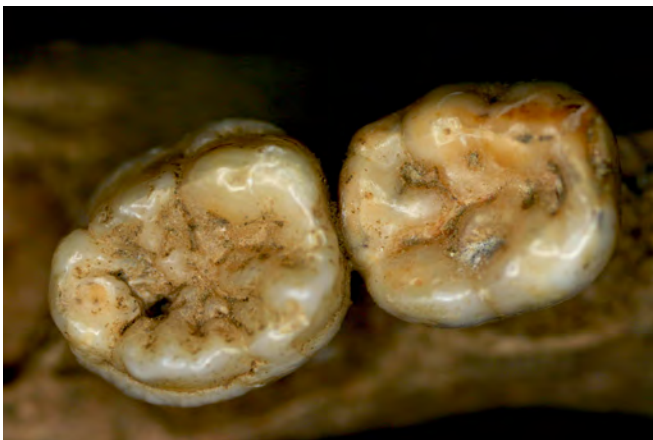
Fig. 11. Occlusal view of permanent left mandibular first molar (left) with circumferential plane-like defect.