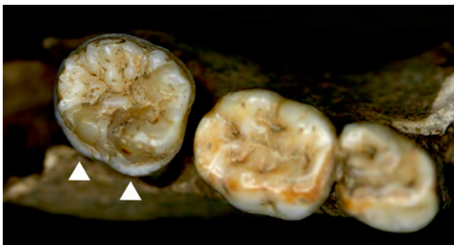
Fig. 7. Occlusal view permanent lower right first molar with reduced irregular cusps and a circumferential plane-like defect (arrows).

Hillson and colleagues (1998:30) succinctly summarize the four most prominently known changes to the permanent dentition associated with congenital syphilis. Here they are represented by examples in form from the present case study. Note that the Level I conditions follow an identifiable pattern both in cases of known syphilis and archaeological specimens, with