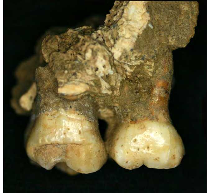
Fig. 10. Interrupted circumferential plane-like defect on the first permanent molar (lingual view).

Showing a marked plane-form hypoplastic defect, cutting sharply into the bases of all the cusps" (Figs. 9-13). The age range for crown defect for the individual presented here is birth to 1.5 years (Goodman and Rose, 1990) to 1.9 years (Reid and Dean, 2006).