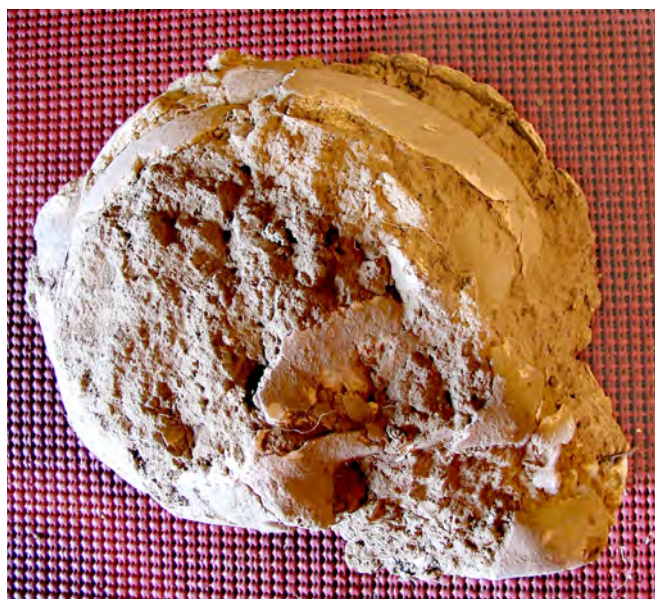
Fig. 17. B10-I11, right lateral view of skull showing taphonomic changes.