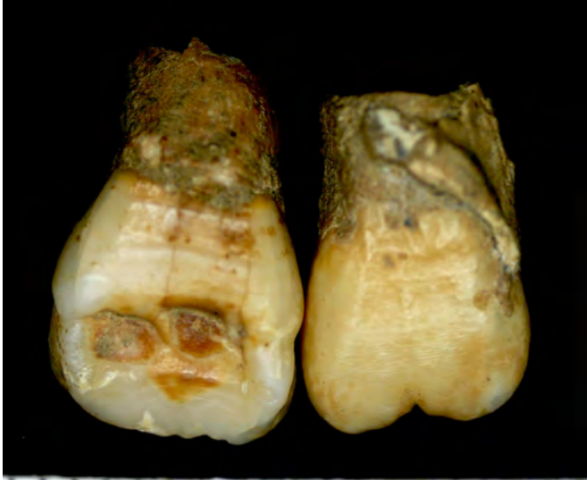
Fig. 1. Labial view of the central maxillary incisors showing patchy hypoplastic defects on the midcrown (right central incisor) and a heart-shaped incisal outline of the crown (left central incisor). The specimen's left maxillary central incisor is on the right of the photograph; the right central is on the left. Scale is in millimeters.

significant because of their timing, as well as their potential association with certain diseases. One such disease is congenital syphilis (Jacobi et al. , 1992; Hillson et al. , 1998). Congenital syphilis is not always detected at birth, as many of its clinical signs develop later (Mansilla and Pijoan, 1995), or, as in the case of the dentition, are not revealed until emergence (Hillson et al. , 1998). Generally, skeletal markers such as bossing of the frontal bone, deformation of the nasal area, and