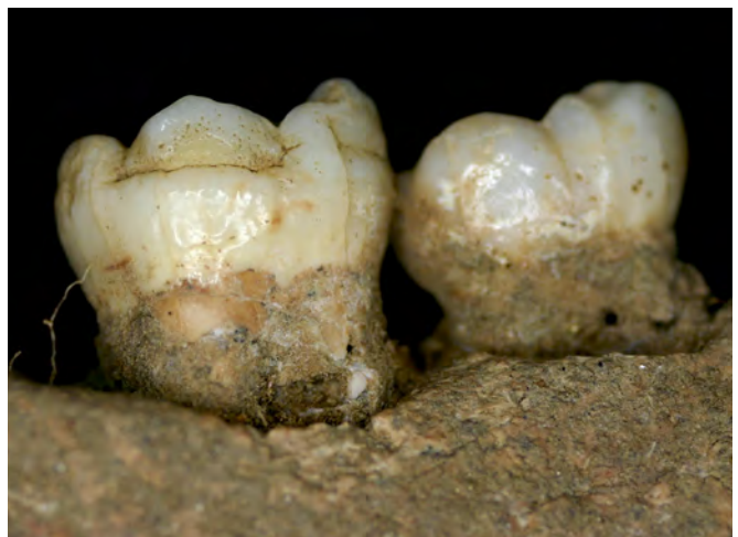
Fig. 12. Interrupted circumferential plane-like defect on the first permanent molar (buccal view; mesial is to the right of the photograph).

The presence of these dental stigmata in a juvenile buried at the Pre-columbian site of Yugué in the Mexican state of Oaxaca are discussed. Occupied from the Middle Formative Period (700 - 400 BCE) until the late Terminal