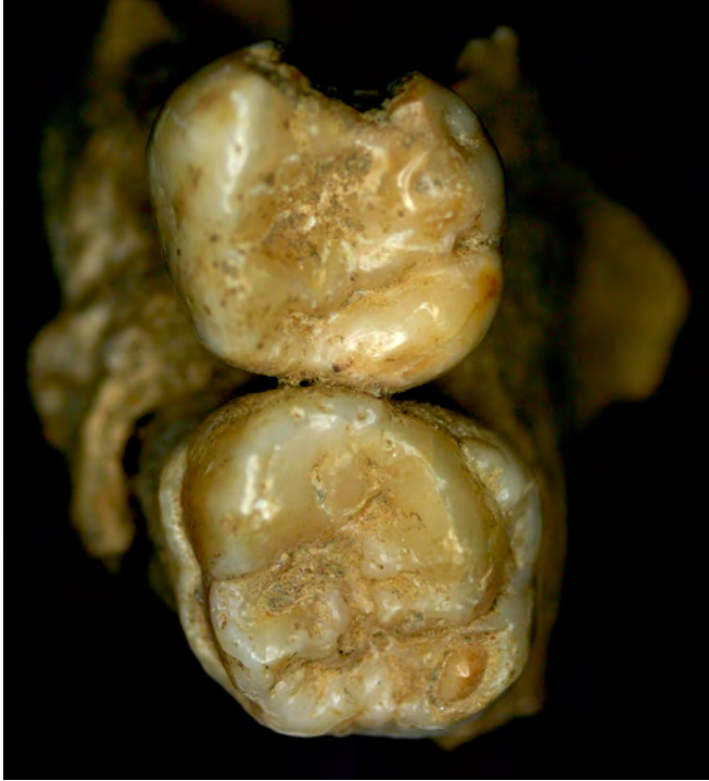
Fig. 9. Occlusal view of permanent right maxillary first molar (bottom) with reduced, irregular cusp and plane-like enamel defect.

and distal crown sides bulging out below it, and marked by a notch of variable shape" (Figs. 1-3).