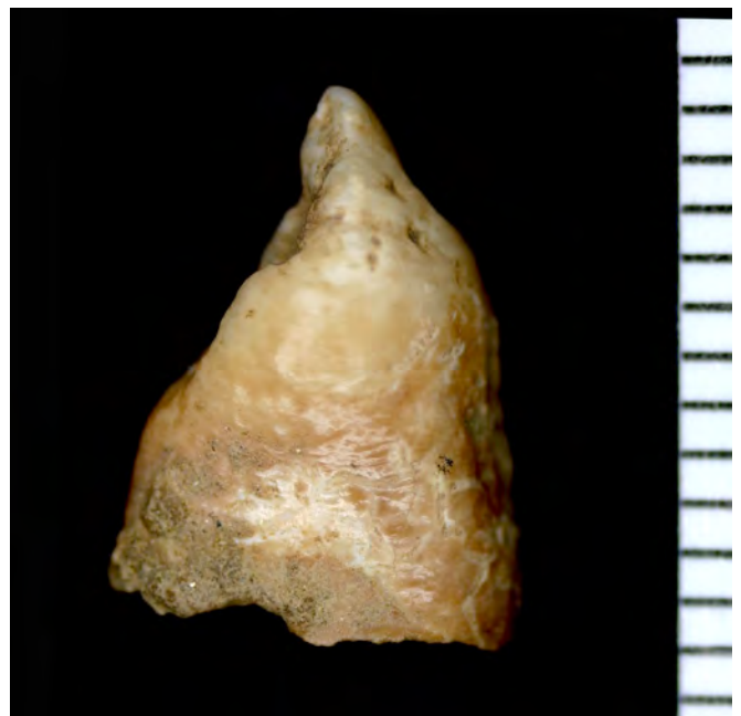
Fig. 4. Lateral view of the left maxillary canine showing the occlusal crown reduction due to extended hypoplastic defect. Scale in millimeters.

inflammation of the tibia, known as sabre shin (Mansilla and Pijoan, 1995; Hillson et al. , 1998; Ortner, 2003), are used to identify congenital syphilis in archaeological collections. However, dental defects such as Hutchinson's incisors, extreme linear enamel hypoplastic defects, transverse pitting in the enamel, Moon's molars, and mulberry molars also are considered symptomatic of the disease (Jacobi et al. , 1992; Hillson et al. , 1998; Ortner, 2003). In archaeological collections, dental stigmata are valuable for diagnosing congenital