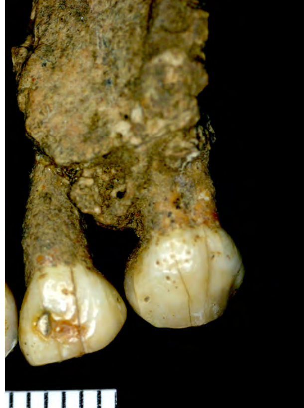
Fig. 19. B10-I11, labial view of the maxillary left lateral incisor with defective enamel in the middle third of the crown. The canine (on the right in the photograph) shows scattered enamel pitting.

Permanent canines exhibit occlusal hypoplastic defects (Jacobi et al. , 1992), and the first permanent molars are also affected by congenital syphilis. A degree of overall consistency is maintained that aids in identification in expected dental stigmata. Descriptive summaries of the defects are also useful in comparing data. Jacobi and colleagues (1992) provide a summary table of descriptions of characteristics attributed to