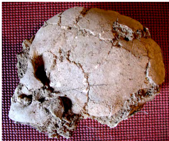
Fig. 16. B10-I11, left lateral view of skull showing taphonomic changes.

The deciduous dentition of this individual is essentially complete, with 19 of the 20 teeth present. There is extensive lytic invasion of the teeth from dental caries. Three out of the seven carious lesions caused decay of over half the tooth surface (URdc, URdi1, ULdm1), and one of these resulted in destruction of the crown (URdc). The other four lesions are not as severe, contributing to less than half of the affected surfaces destroyed (URdm2, URdm1, URdi2, LRdm2). Caries are primarily located on the interproximal surfaces, as well as one on the labial surface. The labial surfaces of the maxillary lateral incisors each have what can be described as wider-than-a-pit hypoplastic defect. On these teeth, the enamel appears to have an eroded or patchy appearance, with dark staining around the margins of the defect. Closer examination using magnification revealed abnormal enamel formation, not labial wear or taphonomic change (Fig. 19).