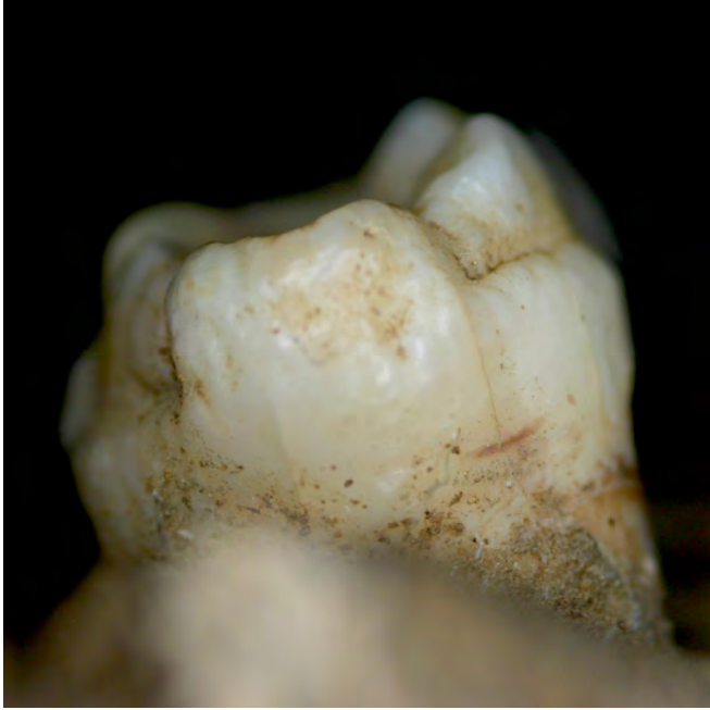
Fig. 13. Distal view, showing the interrupted circumferential plane-like defect on the permanent left maxillary first molar.

a thick crust adhering to the surface of many bones, obliterating any surface changes, and adding to further deterioration of small bones. The material with the best preservation in this collection is the teeth, having gained some protection within the mandible. The taphonomic damage did facilitate determination of the specimen's age: the fragmentary condition of the alveolar bone and loose teeth allowed for the observation of crown and root development of erupting and un-erupted dentition (Figs. 15-18). This was useful given that radiographic analysis of the skeleton was not possible.