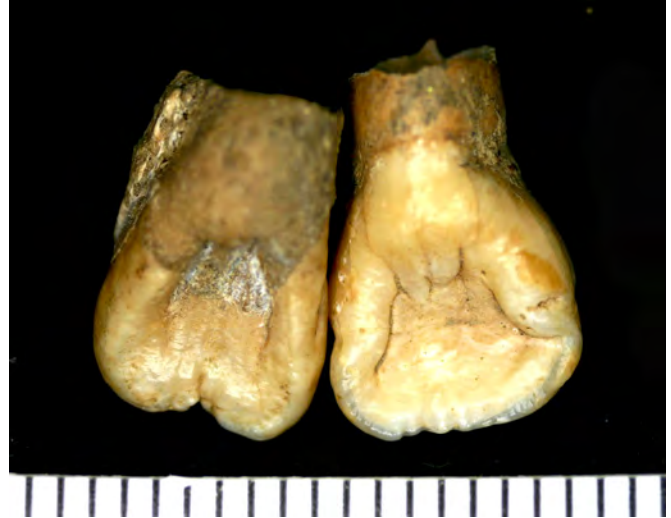
Fig. 2. Lingual view of the central maxillary incisors showing their left-right asymmetry and a heart-shaped incisal portion of the right crown. Scale in millimeters.

inflammation of the tibia, known as sabre shin (Mansilla and Pijoan, 1995; Hillson et al. , 1998; Ortner, 2003), are used to identify congenital syphilis in archaeological collections. However, dental defects such as Hutchinson's incisors, extreme linear enamel hypoplastic defects, transverse pitting in the enamel, Moon's molars, and mulberry molars also are considered symptomatic of the disease (Jacobi et al. , 1992; Hillson et al. , 1998; Ortner, 2003). In archaeological collections, dental stigmata are valuable for diagnosing congenital