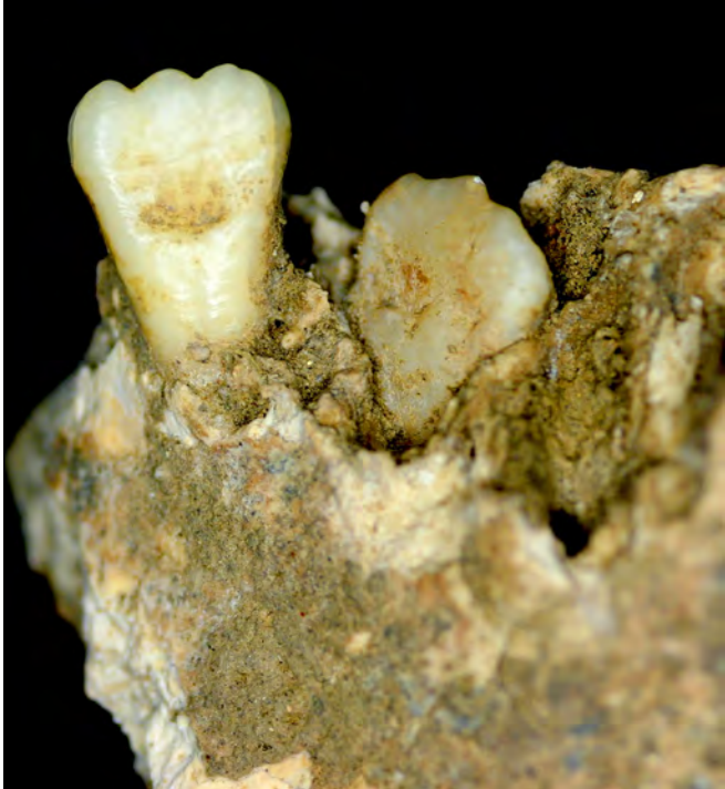
Fig. 20. Deciduous left maxillary lateral incisor with a lingual hypoplastic defect in the middle third of the crown.